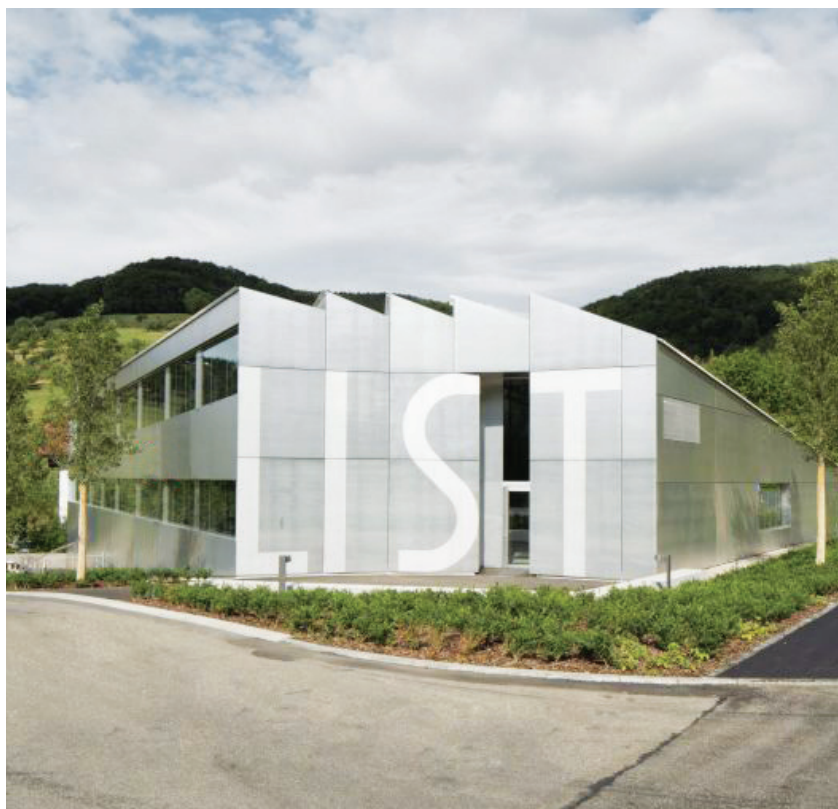
LIST Headquarters and Test Center in Arisdorf, near Basel, Switzerland