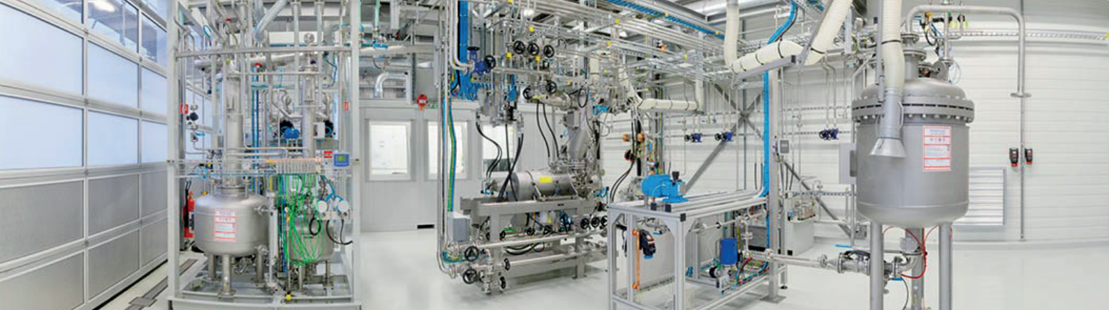
Bay One at our Test-Centre: available for full-stack customization.